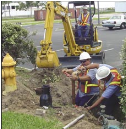
UTILITIES workers improved the water distribution system as part of ongoing work to maintain and upgrade critical infrastructure.