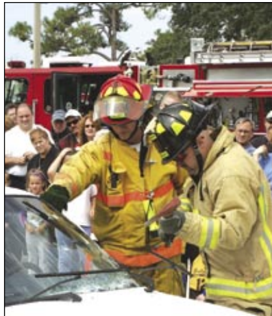
Firefighters staged a community event promoting public safety and demonstrated emergency techniques, including extrication from an automobile.

Another area of work that is seldom noticed by the public is the effort to improve safety and in doing so reduce costs of accidents and claims.