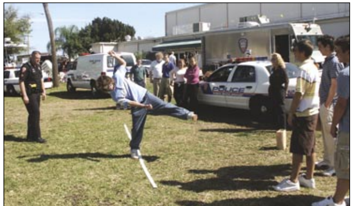
Students participating in Melbourne's High School Government Day tried out glasses that simulate the effects of inebriation on balance.

The funds were put to use to complete infrastructure projects, to provide housing assistance to individuals and families, and to fund vital