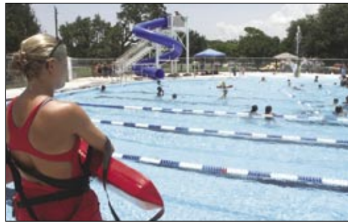
A new swimming pool with special features for the family was dedicated at Fee Avenue Park in 2004.

Melbourne's population as estimated by the University of Florida for 2004 was just under